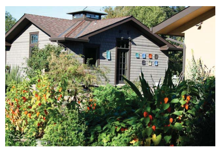
GARDEN AND OFFICE-TEMPLE

weekend course in guided imagery. After the first demonstration, I was completely smitten with the idea that the dream images of the mind could be used to facilitate healing