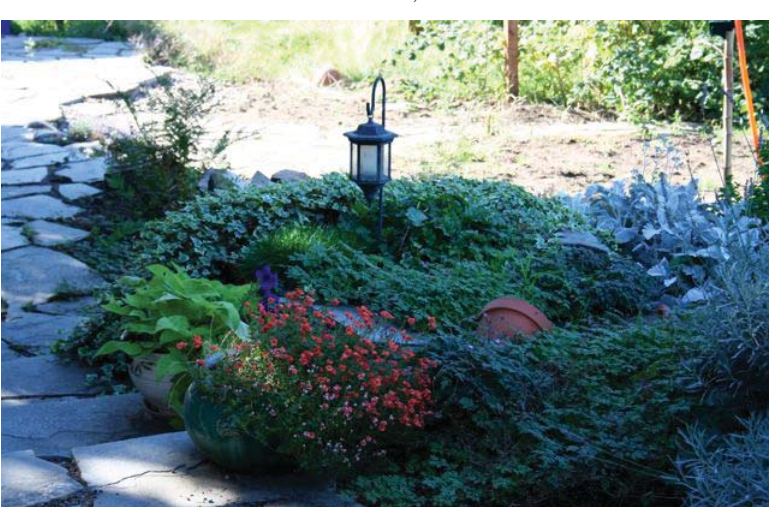
GARDEN WAI KWAY

after the guided imagery workshop, my teenage daughter was severely injured in a car accident. In the months that followed, I used my new skills to facilitate her healing.