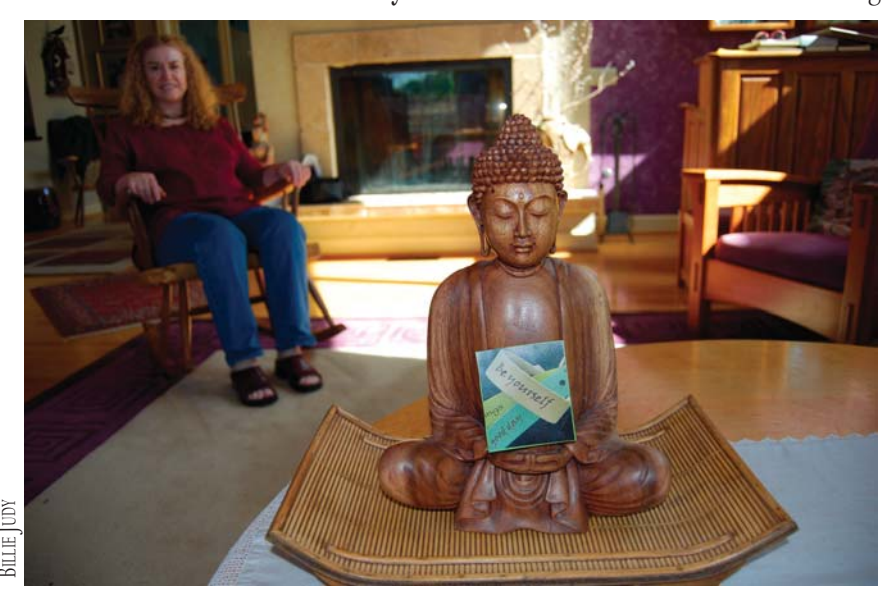
TONI AND BUDDHA IN HOME LIVING ROOM

a small 24' x 24' office building behind our house. The new building serves two purposes: (1) it is where I do my writing, yoga, and other meditational activities, and (2) it is where my clients come that is